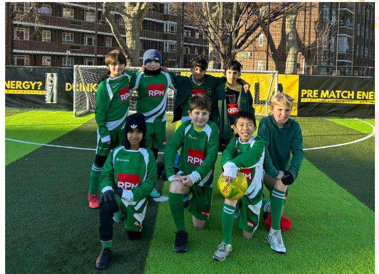
Football, Shepherds Bush Power League

Year 4 have had a fantastic term of cricket coaching, courtesy of Platform Cricket. All of our pupils have enjoyed the weekly sessions, and have learnt a variety of skills and techniques to support with their cricket development.