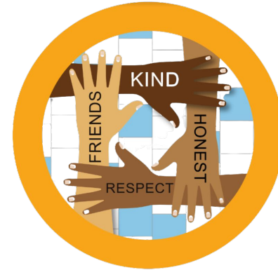
Be kind & respect all