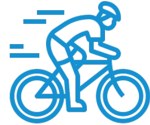
Cycle and tech salary sacrifice schemes