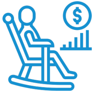
Generous pension scheme