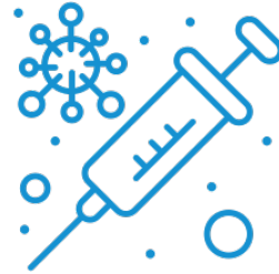
Free flu jab