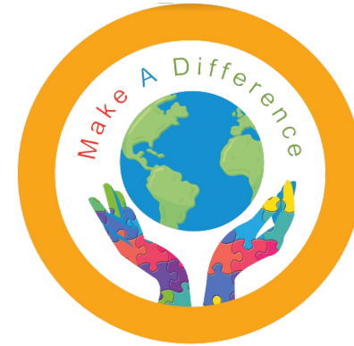
Make a difference