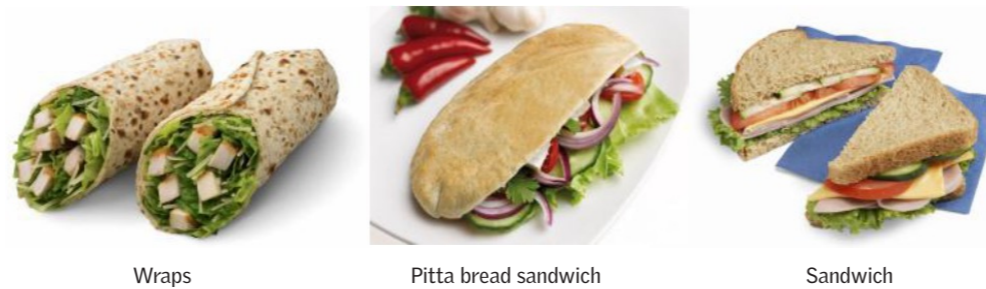
Wraps Pitta bread sandwich Sandwich