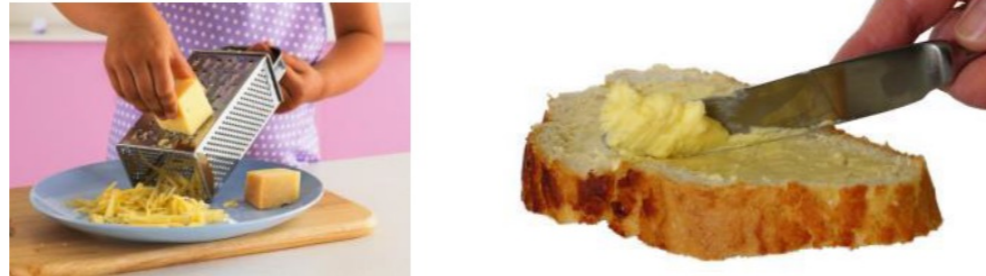
Grating cheese Spreading butter on bread